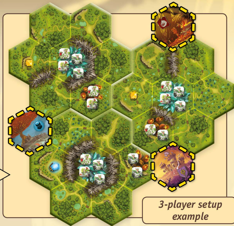
3-player setup example

You can move all or some of your units within the limits of their movement capacity. A Unit moves from one Territory to another connected one at the cost of 1 movement point. A Unit cannot cross Rocky Ranges and must end its move when it enters a Region controlled by enemy Units (Elven or another player's).